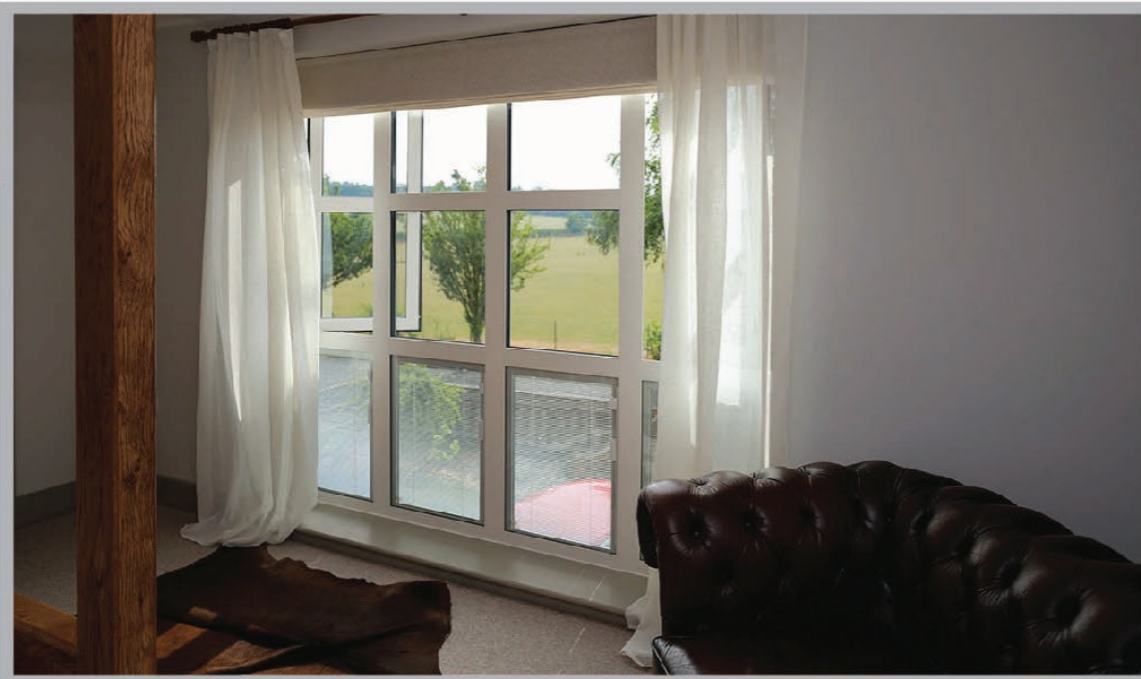
Ideal for windows, bi-fold doors & conservatories

HiTech Blinds are sole manufacturers of blinds sealed between two panes of glass, forming a glass unit. Our experts here at HiTech Blinds have been manufacturing Integral Blinds longer than anyone else in the UK, with over 27 years' experience with the product. We have a strong commitment to offering high quality glazing solutions, while providing excellent customer service and unbeatable prices.